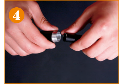
4. Connect the poles one by one