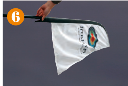
6. When the pole is fully inserted, it should look like this