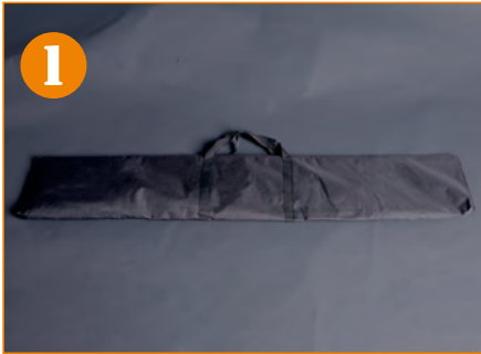
1. Bag with stand