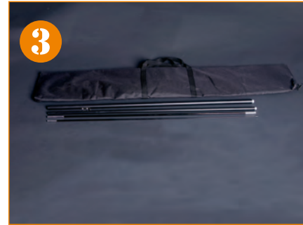
3. Take out the poles