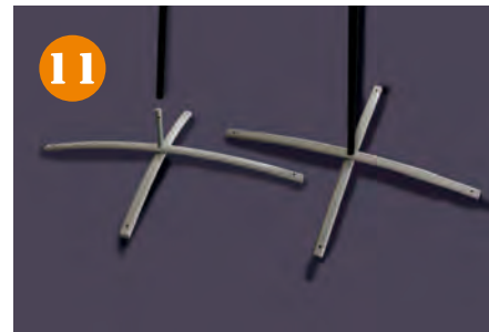
11. Fix the foot for the indoor flag.