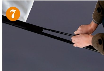
7. Place the bungee cord through the flag hole at the bottom of the sleeve.