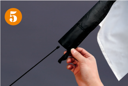
5. Feed the pole into the graphic